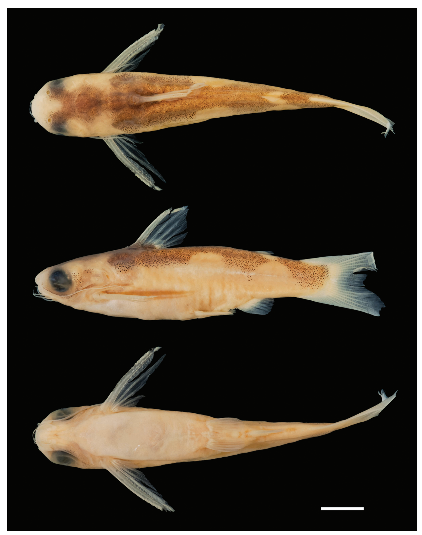
Fig. 1. Tatia melanoleuca , new species, MZUSP 114670, holotype, female, 32.4 mm SL, Brazil, along border between Pará and Mato Grosso states, Jacareacanga, rio Teles Pires, close to Sete Quedas, upper rio Tapajós basin; dorsal, lateral and ventral views. Scale bar = 0.5 cm.