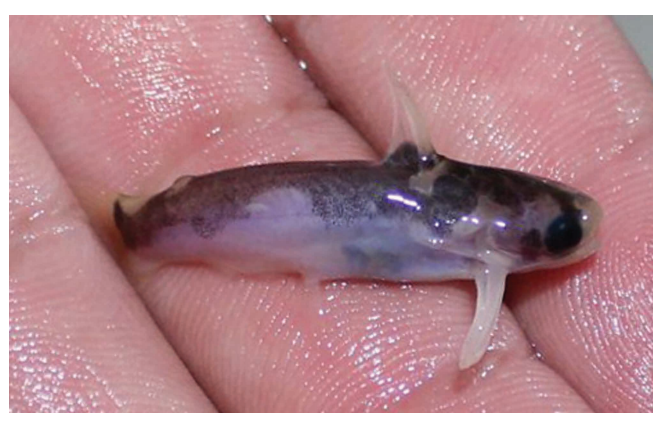
Fig. 2. Life coloration of specimen of Tatia melanoleuca collected in rio Jamanxim, tributary to upper rio Tapajós basin.

Distribution. Examined specimens of Tatia melanoleuca all originated from the rio Teles Pires in the rio Tapajós catchment in the southern portion of the Amazon basin (Fig. 3). Photographed (but not vouchered) evidently conspecific specimens originated in the rio Jamanxim (see Color in Life above), a right bank tributary of the rio Tapajós immediately north of the rio Teles Pires.