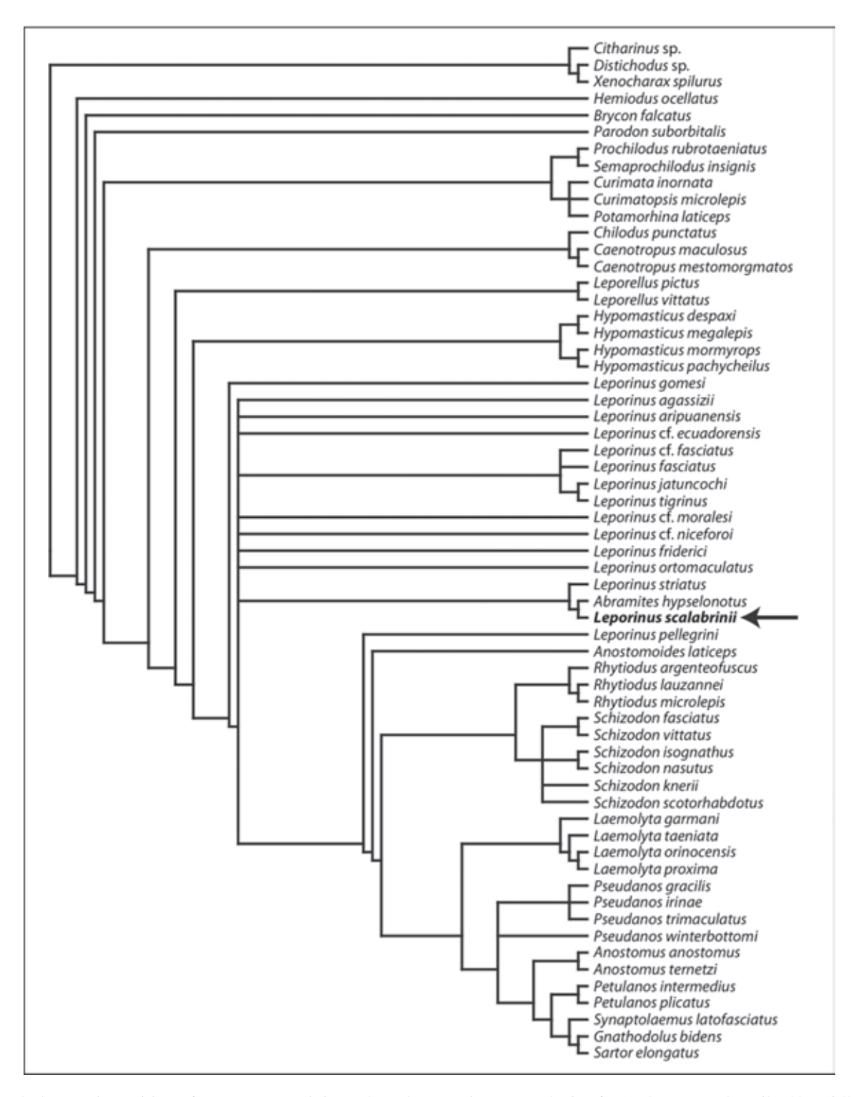
Fig. 3. Phylogenetic position of Leporinus scalabrinii based on parsimony analysis of 158 characters described by Sidlauskas & Vari (2008), 27 of which could be unambiguously coded for the fossil (see Material and Methods for additional details.)