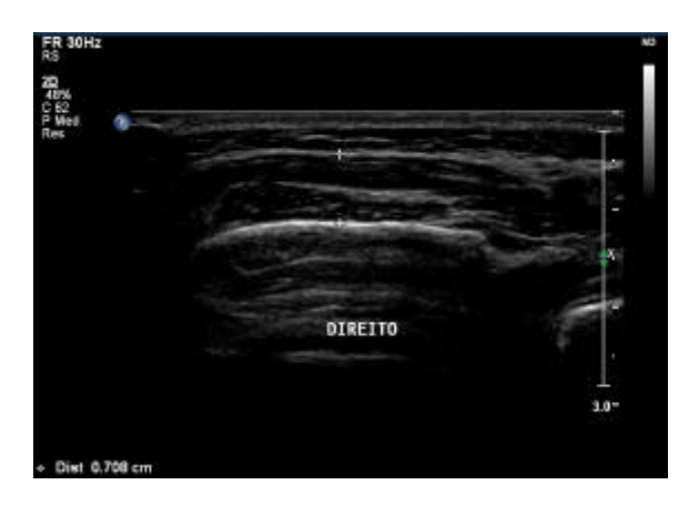
FIGURE 1. Ultrasonographic image of the rest condition (right masseter).

Results indicate that there was a high positive correlation only for the comparison between the right and left sides of the face during the USG assessment.