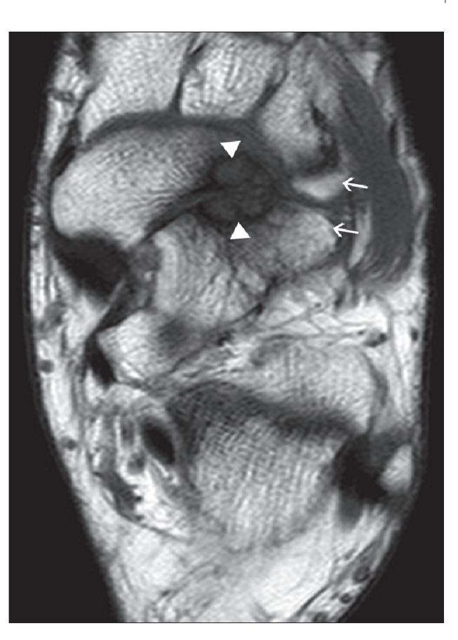
FIGURE 2 T1-weighted transversal MRI of the left foot, showing thinning of the side of the navicular bone, with secondary degenerative talonavicular arthropathy, where sclerosis and subchondral cysts are seen (arrow heads). Approximation of the bony surfaces of the talus and the lateral cuneiform bone (arrow) can be observed.

FIGURE 1 T2-weighted sagittal MRI of the left foot weighted in T2 fat sat, demonstrating flattening with deformity similar to a "comma" of the navicular bone (arrows), a pattern of bone edema and subchondral cysts in the talus and navicular bones.