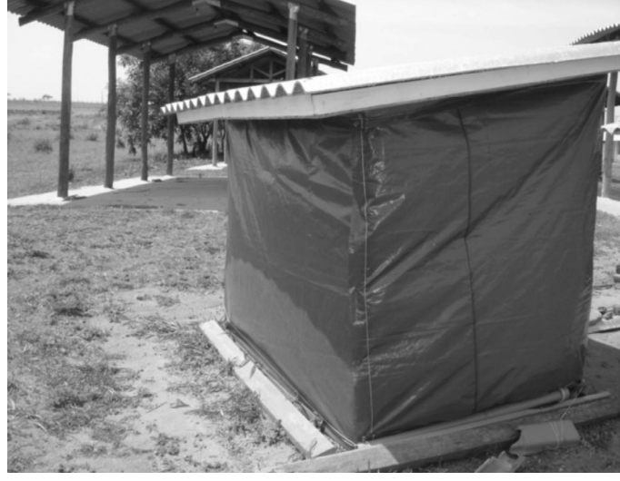
Figure 1 . Experimental prototypes in reduced and distorted scale.

The prototypes' roofs were built with a single água, although this is not the most common design for broiler