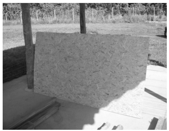
OSB board (10mm)

which is consists of a reforested wood panel made of three pressed layers of wood strands aligned in scales using a synthetic resin (Figure 2).