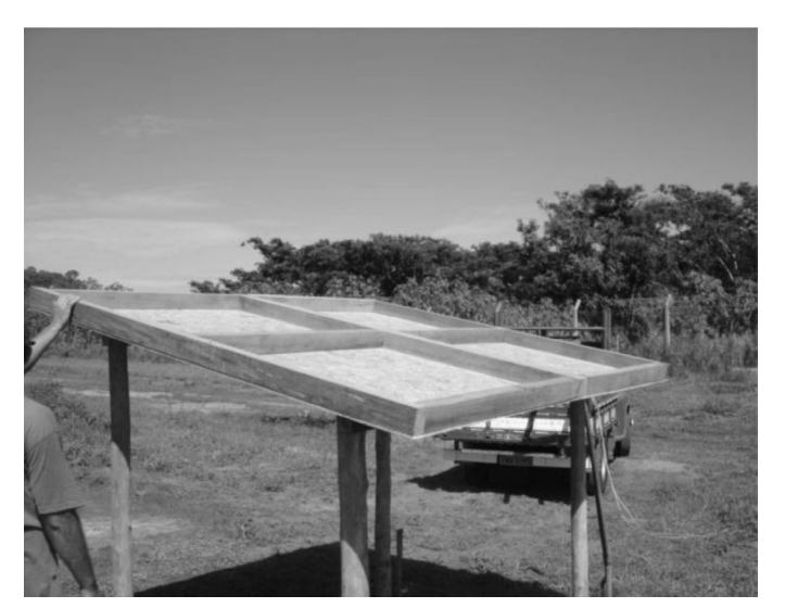
Joining Module 1 and Module 2