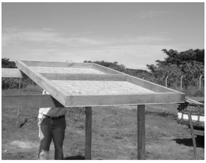
Placement of Module 1