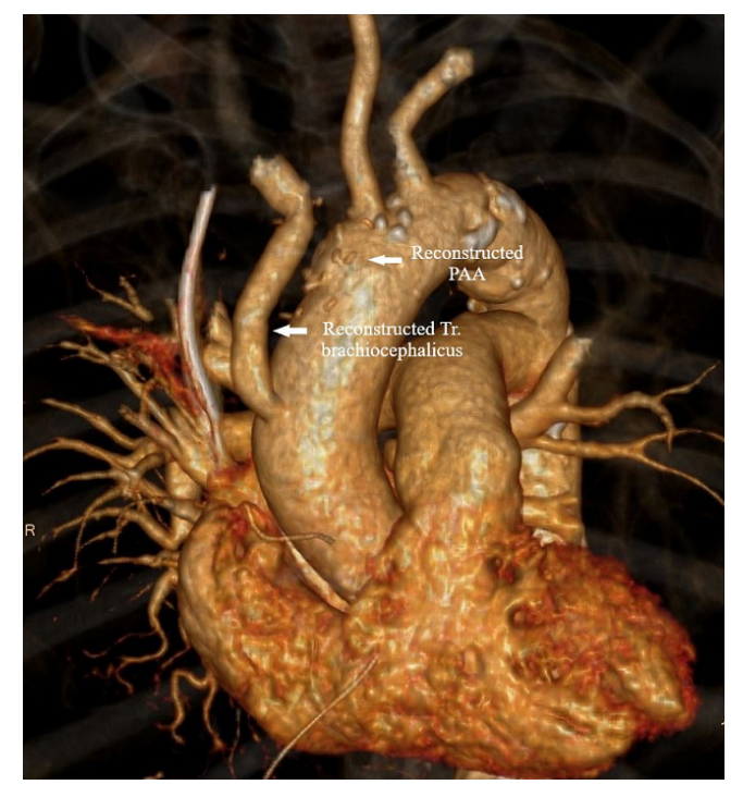
Fig. 3 - MSCT scan examination after surgical reconstruction of ascending aorta and truncus brachiocephalicus.

echocardiography one month after hospital discharge was normal.