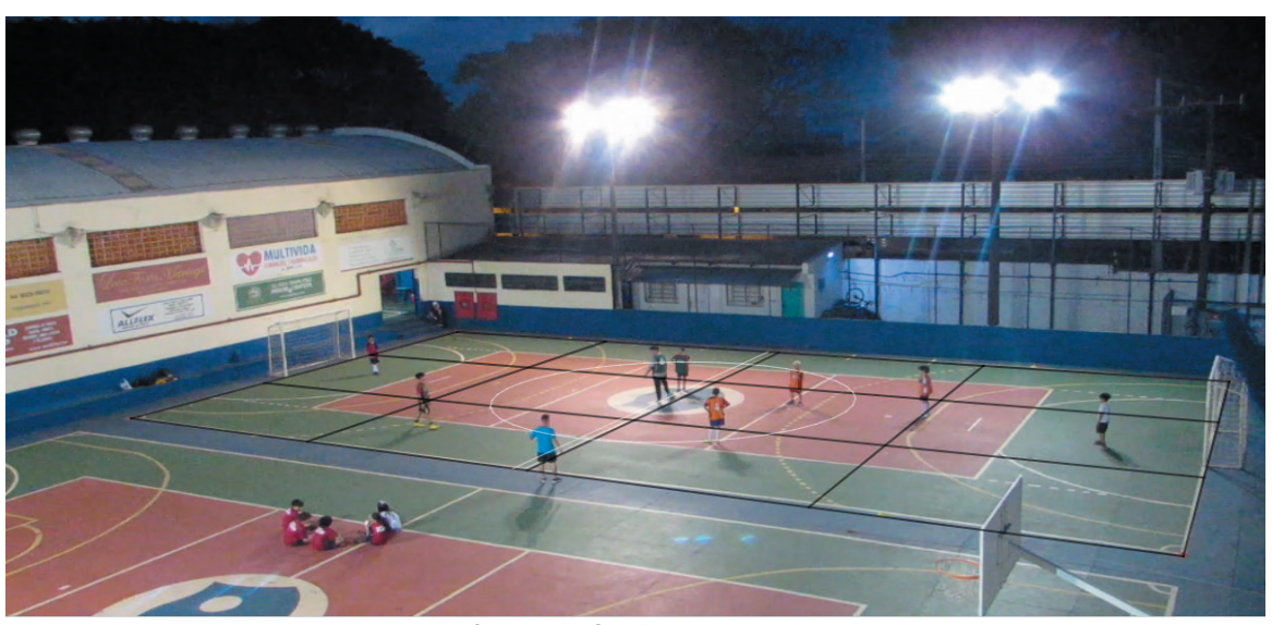
Figure 1. Representation of video analysis using Soccer View® software.

video evaluation. This instrument, developed with the objective of defining indicators to quantify technical actions, considers three distinct functions of the evaluated player: attacker with ball, attacker without ball, and defender. All validation procedures (concurrent, construct, intra-observer and inter-observer reliability) were performed and supported by literature recommendations.