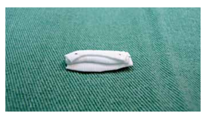
Figure 1 – Polytetrafluoroethylene prepared for implant.

For assessment of results, a table was created with scores from 0 to 5, according to the aesthetic improvement