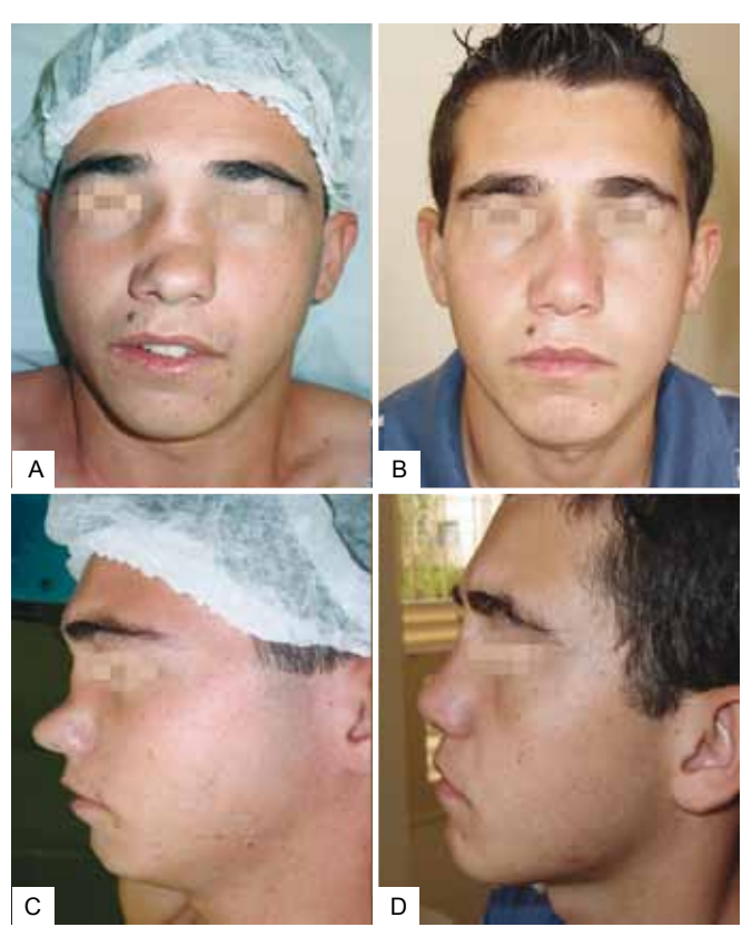
Figure 3 – In A, preoperative period of post trauma rhinoplasty with the use of polytetrafluoroethylene (PTFE) in the nasal dorsum, front view. In B, postoperative period of primary rhinoplasty with the use of PTFE in the nasal dorsum, front view. In C, preoperative period of primary rhinoplasty with the use of PTFE in the nasal dorsum, left lateral view. In D, postoperative period of post trauma rhinoplasty with the use of PTFE in the nasal dorsum, left lateral view.

Owsley and Taylor<sup>5</sup> noted no complications among 106 patients who used Gore-tex implants for a period exceeding 5 years. In 1999, Godin et al.<sup>4</sup> monitored 309 patients for an average of 40.4 months and reported a complication rate of 3.2%. Another study, published by Conrad and Gillman<sup>9</sup>, reported 7 instances of complications in 189 patients followed-up for 17.5 months.