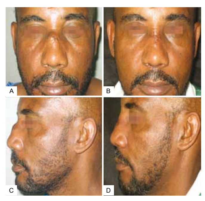
Figure 4 – In A, preoperative period of post trauma rhinoplasty with the use of polytetrafluoroethylene (PTFE) in the nasal dorsum, front view. In B, postoperative period of post trauma rhinoplasty with the use of PTFE in the nasal dorsum, front view. In C, preoperative period of post trauma rhinoplasty with the use of PTFE in the nasal dorsum, left lateral view. In D, postoperative period of post trauma rhinoplasty with the use of PTFE in the nasal dorsum, left lateral view.