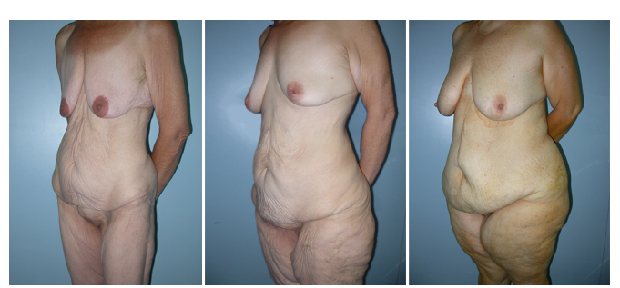
Figure 1. Examples of patients after major weight loss.

After treatment of morbid obesity, the patient evolves with great weight loss, consequently decreased thickness of adipose tissue (hypodermis), skin sagging, and extensive skin folds distributed in various areas of the body <sup>1</sup>. The superficialis fascia , distended while the patient was obese, now presents loose<sup>2</sup>. The post-bariatric patient's skin has lower retraction capacity and decreased elasticity, mainly provided by the lower density of collagen fibers in dermal matrix<sup>3</sup> or higher proportion of fine fibers than thick fibers<sup>4</sup>. This complex condition is defined as body dysmorphia, and, in these circumstances, we identified patients with a small amount of subcutaneous adipose tissue and significant excess skin (Figure 1).