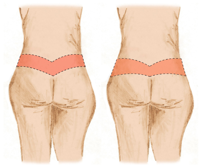
Figure 4. Demarcation of the posterior resection area of the circumferential abdominoplasty; A. Preview, with parallel lines; B. Current, lower and with convergent lines towards the vertex over the intergluteal groove.

dorsal region. This promoted the trunk's waistlines, but it became difficult to cover the scar with the bathing suits. At this time, there was partial dehiscence of the posterior scar on the coccyx in some patients, caused by excessive tension on the scar because the posterior incisions were parallel. Since then, the distance between the posterior demarcation lines in the area over the coccyx has been decreased. Thus, this intercurrence became infrequent (Figure 4).