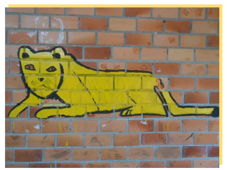
Image 6 – Painting done in a classroom of the Karaí Arandú school.

The works seen at the museum in little resembles what they produce at the school in the curricular discipline called arts. The guarani drawings, paintings and graphisms on the walls and columns of the school or in the classrooms are an evidence of creation processes of ethnic and political affirmation, and appropriation of school spaces. Likewise, we highlight that guarani aesthetic expressions, such as their paintings, can be understood as political practices of decolonial aesthetic in education. We also realized a probable difference in the understandings of the art concept. For the juruá , the artistic practice has multiple creation and expression understandings, while for the guarani, its understanding is utilitarian and sacred. With which concepts do the guarani people visit the museum? What are their inner questions about the art presented?