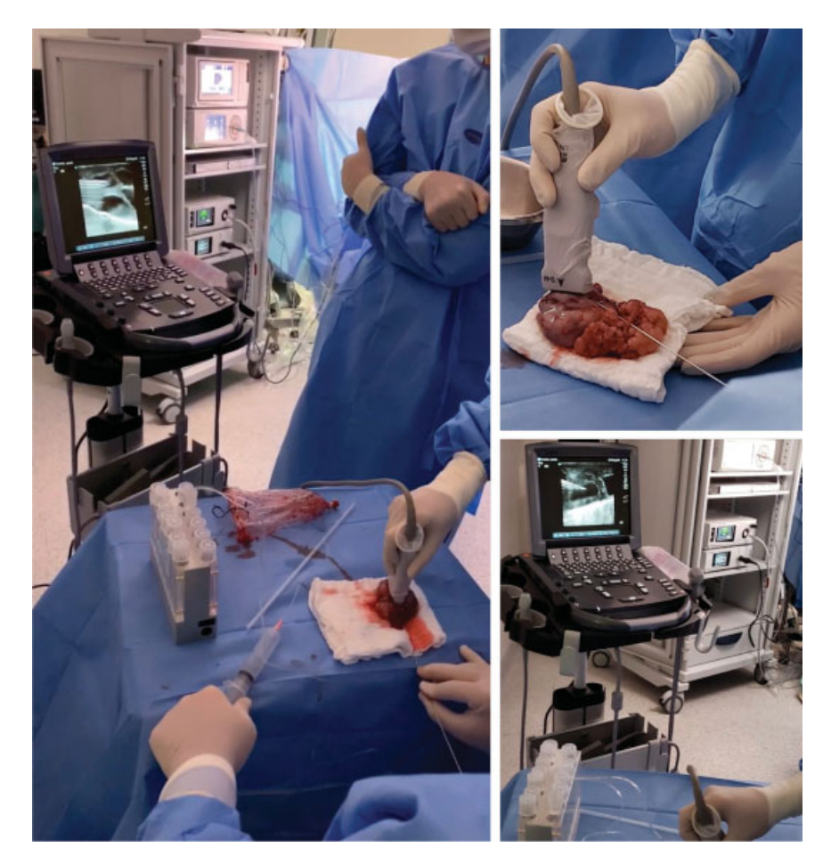
Fig. 1 Oocyte retrieval set. Up in the right, follicular aspiration with a standard aspiration single lumen needle, in a closed system connected directly to the tubes, under ultrasound guidance, using a 6–13 MHz linear probe applied directly to the specimen. Down in the right, sonographic view of the needle during guided follicular aspiration.

A 28-year-old married nulligravida, weighting 62.5 kg (body mass index 21.37 \text{ kg/m}^2 ), was referred by her gynecologic