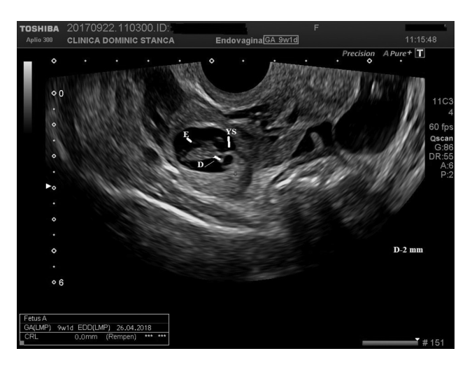
Fig. 2 The distance between yolk sac and embryo in a pregnancy with an embryonic demise.

distribution indicators. The Shapiro-Wilk test was used to test normal distribution. The variance was tested with the F test. In the case of normal distribution of data, the Student ttest was used, and in the case of nonuniform distribution