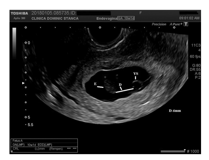
Fig. 1 The distance between yolk sac and embryo in a physiological first-trimester pregnancy.