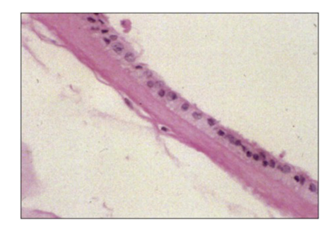
Figure 1: Amniotic membrane sample stained with hematoxylin-eosin. It is possible seeing a single layer of cuboid epithelial cells covering the basement membrane and the loose stromal connective tissue. (14). Source: Krachmer JH, Mannis MJ, Holland EJ. Cornea. 3rd ed. New York: Elsevier; 2011.

The epithelial amniotic layer is a simple layer comprising cuboidal and columnar cells with microvilli on the apical surface. The epithelium is located over the basement membrane (BM), which strongly resembles the conjunctival BM. Substantia propria has a compact collagen layer that promotes tensile strength, as well as a fibroblastic layer, which is the thickest AM layer that consists of fibroblasts embedded in a loose reticular network. The mucin-rich spongy layer is the outermost MA layer and the closest to the chorion.<sup>(13)</sup> The last 3 layers may be hard to be distinguished in case of histological examination applied to cryopreserved tissues (Figure 1).