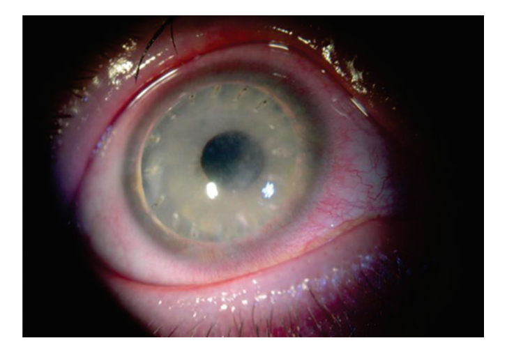
Figure 2: Ocular hyperemia of the right eye with anterior chamber reaction (2+/4+), inferior stromal edema with presence of Kodadoust line.

Figure 1: Left eye with interstitial corneal infiltrates associated to reactive conjunctival hyperemia and deep corneal vascularization, similar to that of the right eye before corneal transplant.