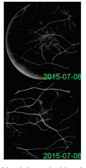
Figure 1: Angiofluoresceinography of the retinal temporal periphery of the left eye.