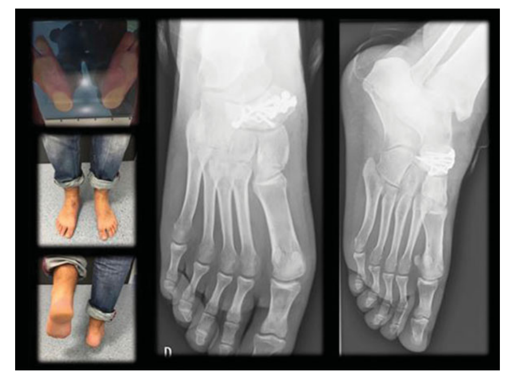
Fig. 5 At 34 weeks of follow-up: clinical examination (with no valgus/planus or varus/valgus deformity) and radiological assessment.

Tarsal navicular fractures can range clinically from an almost normal foot to a severely injured lower extremity. The high rate of suspicion and awareness of the potential serious injuries (like compartment syndrome) must be addressed