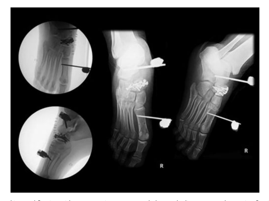
Fig. 3 Open reduction and internal fixation with an anatomic precontoured plate and adjunct external spanning fixation (with talus neck and first metatarsal pin placement).

At 34 weeks of follow-up, the American Orthopedic Foot and Ankle Score (AOFAS) was 87 (out of 100) points. Clinically, the patient had minimal and occasional pain. No union alterations or posttraumatic arthritis were observed. During the course of the treatment, soft-tissue integrity was an