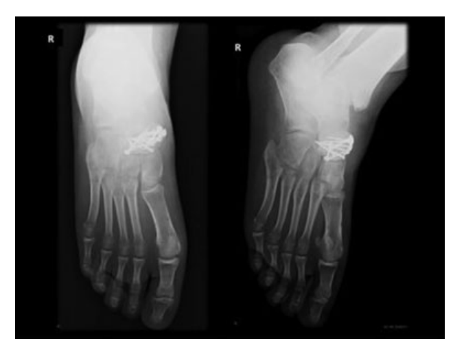
Fig. 4 Fracture healing (15 weeks postoperatively).

important issue, especially in the early period after the ORIF. However, at the end, no complications were observed, and the final esthetic result was good. Biomechanically, there was no impairment in high-demand activities such as running, although there was a slight limitation in inversion compared to the contralateral foot. Upon clinical examination, he had normal gait and no varus/valgus alignment or pes cavus/ planus deformity compared to the contralateral foot ( ~Fig. 5 ).