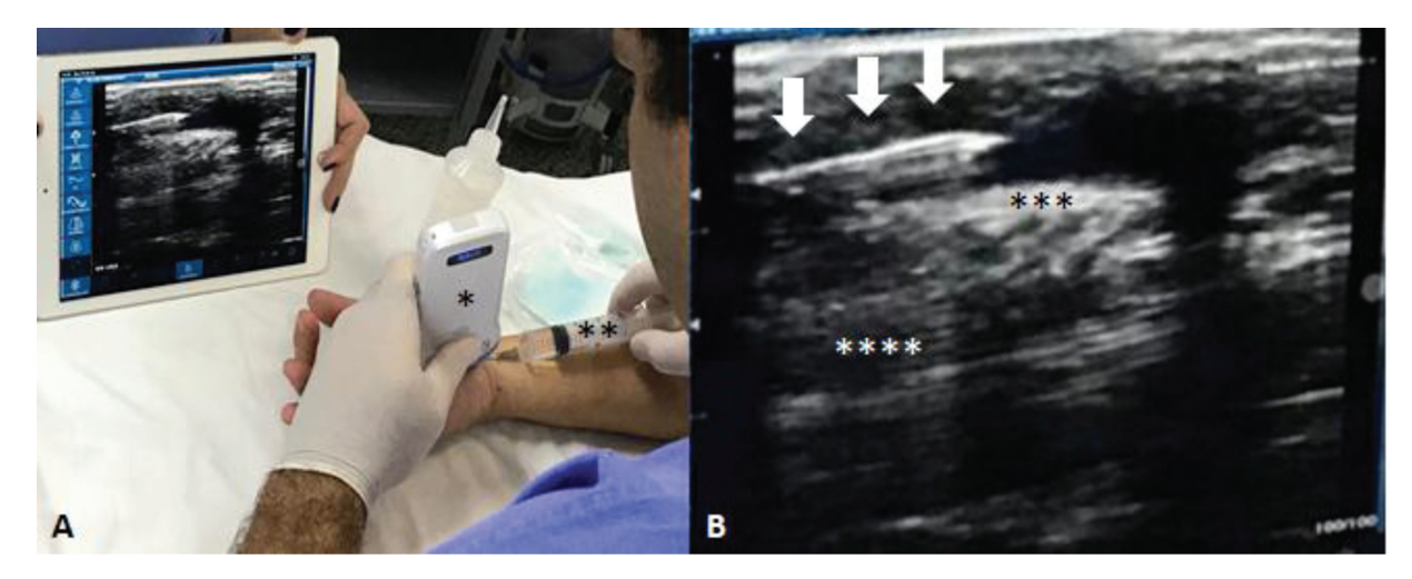
Fig. 2 (A) Right upper limb of the patient in supine position on the hand table. A portable ultrasound with a linear probre<sup>*</sup> (Mobissom) is positioned volarly and longitudinally on the carpus, in the projection of the surgical incision. A gray hypodermic needle, measuring 25 mm x 0.70 mm and attached to a 20-ml syringe,<sup>**</sup> is introduced through the wrist crease and distally directed between the dermis and the flexor retinaculum (FR). With the ultrasound image transmitted to an iPad (Apple) (B), the needle (white arrows) is positioned between the dermis and the FR,<sup>***</sup> and a volume of \sim 10 ml of xylocaine solution at 1% with vasoconstrictor is injected. In image B, the deep median nerve to the FR is also observed, longitudinally.<sup>****</sup>

With the patient in dorsal decubitus position and the upper limb on a hand table, after degermation and antisepsis, the US linear transducer is placed transversely on the wrist, and the median nerve is identified. A total of 10 ml of 2% xylocaine with vasoconstrictor is diluted with 10 ml of 0.9% saline, obtaining a volume of 20 ml of 1% xylocaine. From the anesthetic solution obtained, 6 ml to 10 ml are used in the first step, and the remainder is used in the subdermal region of the surgical incision, through a gray hypodermic needle measuring 25 mm x 0.70 mm, which can be visualized on US, as shown in ~ Figs. 1B and 2B .