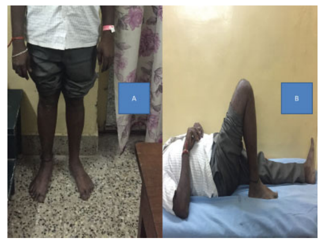
Fig. 5A and 5B Patient 9 with 12 months of follow-up.