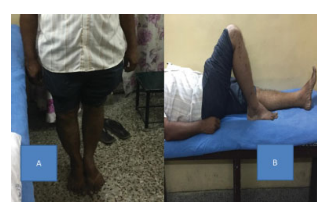
Fig. 9A and 9B Patient 13 with 60 months of follow-up.