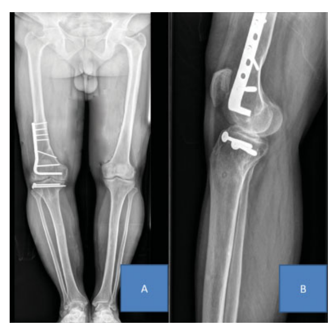
Fig. 8A and 8B Anteroposterior and lateral radiographs of Patient 13 with 60 months of follow-up.

varying degrees, and leads to skin breakdown when internal fixation is performed.