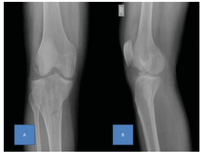
Fig. 6A and 6B Preoperative anteroposterior and lateral radiographs of Patient 13.