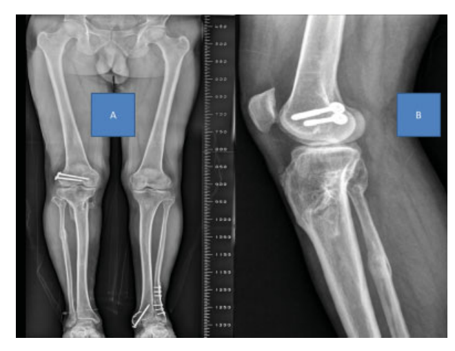
Fig. 4A and 4B Anteroposterior and lateral radiographs of Patient 9 with 12 months of follow-up.