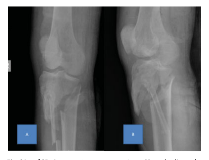
Fig. 2A and 2B Preoperative anteroposterior and lateral radiographs of Patient 9.