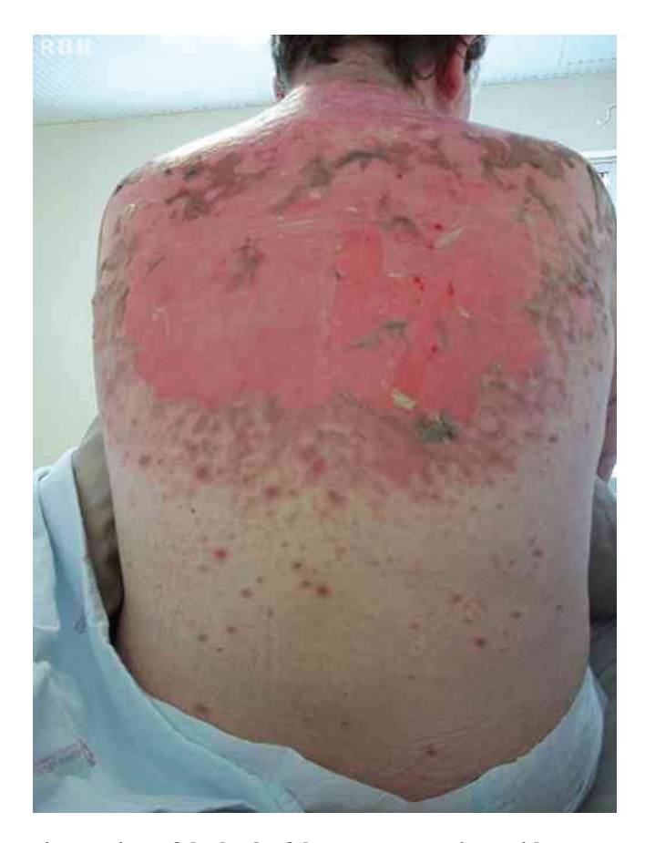
Fig. 1 – View of the back of the pregnant patient with SLE presenting bullous lesions.

Four months later, she presented with extensive erythemato-squamous lesions on sun-exposed areas, with mild pain and itching. The prednisone dose was increased to 60 mg (approximately 1 mg/kg), and an early outpatient reassessment with laboratory tests was scheduled. On the follow-up visit, the patient demonstrated bullous, hyperaemic and squamous lesions on the face, trunk and upper limbs (Fig. 1). She did not report any association between the disease onset and concomitant infections or use of other drugs.