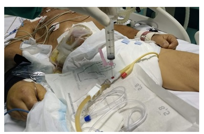
Figure 2. Insertion of the 2-way bladder catheter and sterile collector system used with a puncture in the collection portal. Submitted by: Bruno Souza Caldas.

Place the saline support next to the patient with a CVP ruler, with the zero mark at the level of the patient's midaxillary line.