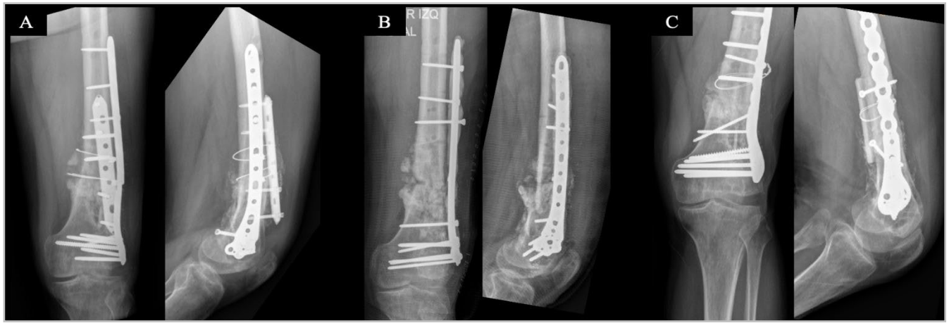
Figure 2. Case 2. A. Antero-posterior (AP) and lateral radiographs of the distal region of the left femur, showing osteosynthesis failure, with plaque breakage and oligotrophic infected pseudarthrosis of the distal femur metaphysis; B. The implants were removed and an antibiotic cement-coated block plate was used for stabilization. AP and lateral radiographs show persistent nonunion; C. The second reconstructive surgery was performed, with implant removal and bone healing with a structural allograft. AP and lateral radiographs of the second reconstructive surgery showing the new fixation and structural graft.

Radiographic bone healing was observed in 12 (80%) patients. In three (20%) patients, implant removal and further surgery were required. Bone consolidation ended up occurring in two (13.3%) of these patients after the implant was replaced and the induced membrane technique or structural allograft placement was performed (Figure 2). As mentioned earlier, an antibiotic spacer was used in one (6.7%) patient with a persistent infection in the proximal femoral region.