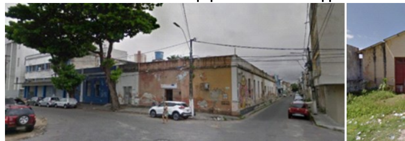
Figure 4 - SPU Building (left) and RFFSA Warehouses (right) requested by the MNPR for the construction of equipment and HIS to support the homeless population