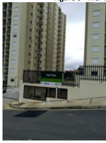
Figure 3 - Frei Tito and Nelson Mandela Housing Complexes - São Bernardo do Campo

that made possible the reform of buildings in central and well-located areas and has provided good examples of producing quality housing at low cost (Figure 3).