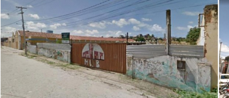
Figure 5 - Land occupied by the MLB (left) and Building of the former Albergue da Prefeitura by the MLB

The City Hall negotiated with the families to vacate the land, which was incorporated into the IFRN property. Of the total, 110 of them were included in the PMCMV and served in the Conjunto Village de Prata – in the distant Planalto neighborhood (about 11 km away). Those families that were not included made a new occupation, this time in an old vacant hostel of the City Hall, on Rua Câmara Cascudo, also in Ribeira (Figure 5). This occupation, like the other one, has the objective of putting pressure on the municipal government to talk about housing solutions for the other families in the movement, since the previous service was not enough.