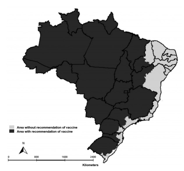
Figure 1 - Area with and without recommendation of yellow fever vaccine, Brazil.

which the vaccine is recommended (1998 and redefinition in 2003)<sup>10</sup>. In October 2008, there was a new delimitation of these areas, as shown in Figure 1: an area where the vaccine is recommended corresponding to the area where the risk of transmission is recognized, and an area without vaccine recommendation, corresponding to the "indene areas", with no evidence of viral circulation<sup>11</sup>.