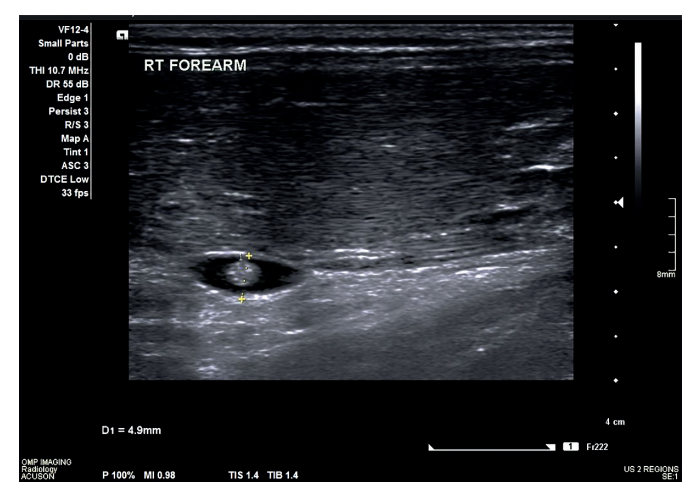
FIGURE 2: Ultrasound evaluation of the right forearm showed hypoechoic cyst with a mural nodule.

of cysticercosis is rarely reported<sup>2</sup>. Our patient did not show signs of eye involvement, but all other commonly affected organs (i.e., the subcutaneous tissue, central nervous system and skeletal muscle) were involved. Due to financial constraints screening was limited to commonly affected organs; therefore, the involvement of other organs could not be excluded.