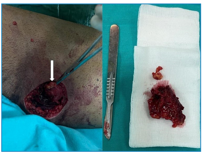
FIGURE 2: Image from an intraoperative procedure.

daily. The spontaneous rupture of muscular hydatid cysts is an extremely rare condition. The rupture of hydatid cysts into the muscle poses a considerable challenge for surgeons. Pericystectomy is the primary treatment for the muscular rupture of hydatid cysts, with medical treatment typically administered postoperatively<sup>1,2</sup>. It is important to consider hydatid disease in the differential diagnosis of cystic swelling in a musculoskeletal region<sup>3</sup>.