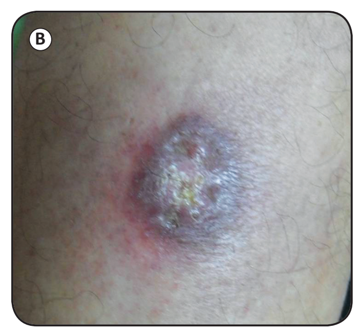
FIGURE 2 - A) Ulcerated and crusted nodule in the right pretibial area. B) Remarkable improvement observed after 4 months of antituberculous treatment.

practice<sup>(5)</sup>. Clinical manifestation of cutaneous tuberculosis is so variable that a high index of suspicion is required for diagnosis. Cutaneous tuberculosis is classified according to the source of the skin infection. Endogenous infection occurs in a host previously infected with Mycobacterium tuberculosis via contiguous hematogenous or lymphatic extension, and exogenous infection results from direct inoculation of bacteria into the skin<sup>(6)</sup>.