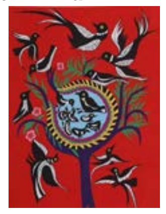
(YANG; CHEN; XIE, 1999, p. 6).

For example, the gourd, the most common image in Ansai peasant paintings, is obviously the remains of female reproductive worship in a matriarchal society. The gourd has three meanings in folk art creation: first, there are many seeds in the gourd, which means many children and grandchildren. Second, the gourd symbolizes the mother of life. Third, the vines are covered with large gourds and small gourds, which is a metaphor for the numerous and endless descendants. The Chinese nation has a tradition of worshipping gourds. Liu Yaohan (1983, p. 136) wrote in the article "The Primitive Gourd Culture of the Chinese Nation" about "Gourd Worship" that "[...] there are many melons, large and small, on a continuous vine like people's descendants." means that the ancestors of the Chinese nation originally came from the common mother-gourd, which has lasted for generations and multiplied for generations. In fact, the gourd is regarded as the combined ancestor god of the intersection of Yin and Yang between men and women, which is integrated into one and divided into two halves: one for male and the other one for female. The intersection of Yin and Yang, between