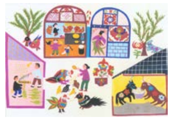
Figure 8 - The conceptual modeling of transcending time and space in the Ansai peasant painting "Farmyard"