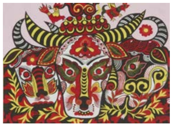
Figure 9 - The concentrated embodiment of colors in the concept of Yin-Yang and Five Elements in "Cattle Head" by Xue Yuqin