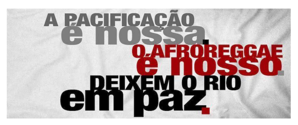
Pacification is ours. Afroreggae is ours. Leave Rio in Peace.

The fear of the dissolution of the police pacification units reached not only residents of the "pacified" favelas, but also artists, business people, athletes, professionals and social entities that had publically defended the project in the second half of 2013. A group of city residents decided to create a "protection network" for the pacification units as indicated in the article in the O Globo newspaper of August 24, 2013. They launched the "Leave Rio at Peace" movement, which arouse as a reaction to the "traffickers attacks" on the offices of AfroReggae in the Complexo do Alemão in late July.