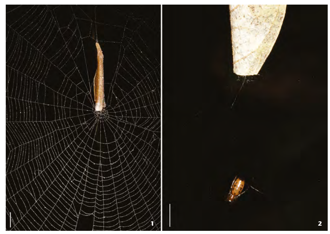
Figures 1-2. Hingstepeira folisecens orb web in an area of the Amazon forest, Brazil: (1) vertical orb web with the rolled dry leaf used as a shelter by the spider attached to the hub; (2) shelter's detail showing the entrance oriented just downwards and the spider leaving it. Scale bars: 1 = 10 mm, 2 = 5 mm.

when prey is intercepted far from the entrance of the shelter, the pulling behavior may result in energetic costs and exposure to predators during web repairs. In addition, if prey is intercepted at the upper web region, the spider will have to leave the shelter, turn around and move from the center upwards. Since this sequence of movements may demand more time outside the shelter, the spiders should be less prone to capture prey intercepted at the upper web region when compared to prey intercepted at the lower web region.