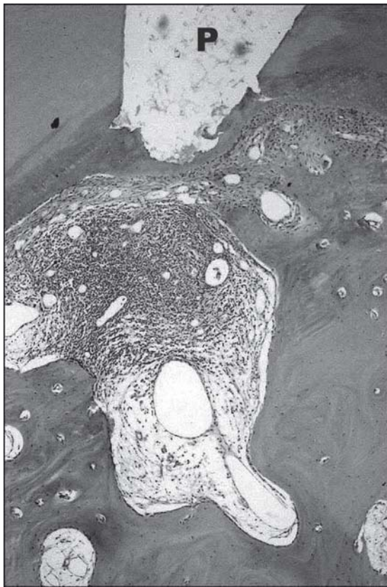
FIGURE 3- WPC, with complete new formation of mineralized tissue at the site of perforation (P), organizing periodontal ligament, regardless of the inflammatory infiltrate. Hematoxylin and eosin – Olympus 10X