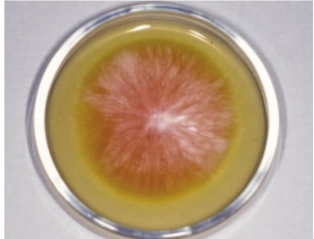
FIGURE 3: Microsporum canis . Plan, white-cottoned radiated colony, against golden yellow background.

canis to treatment with terbinafin 26,27 have to be considered, that is, when the isolated species is M. canis , decision-making regarding treatment should take into account a differentiated usage time or the possible failure in case terbinafin is the chosen drug. The same clinical reasoning applies when the infecting species is not identified, but the patient comes from a region where epidemiological evidence indicate M. canis as the prevailing organism. Itraconazole, in the dose of 5 mg per kilogram of body weight, seems to be equally effective, be the isolated fungus M. canis or T. tonsurans , 28 even though there may be restrictions to its use in virtue of its cost or less experience of its use in