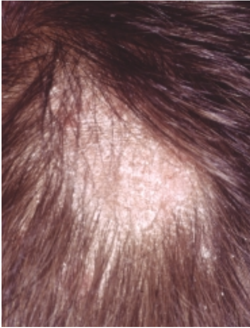
FIGURE 1: Erythematous desquamative alopecia in parietocipital region of a child with tinea capitis