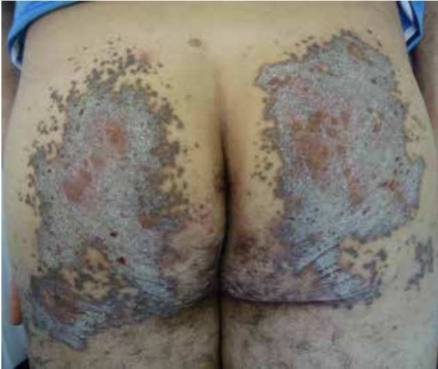
FIGURE 1: Gluteal lesions characterized by hyperkeratotic plaques