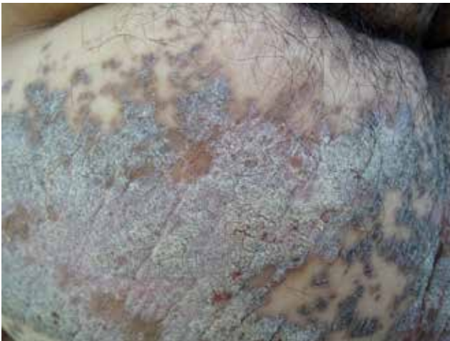
FIGURE 2: Detail of the periphery of the lesion in the left gluteus