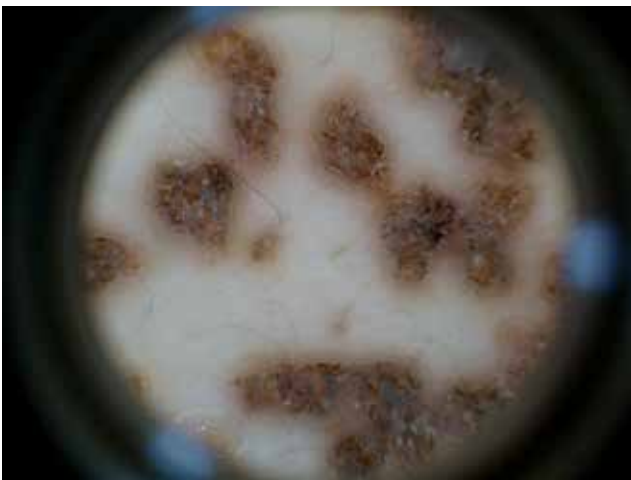
FIGURE 3: Contact dermoscopic examination in polarized light showing hyperkeratosis and well-defined edge