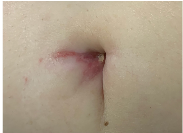
Fig. 1 A single violaceous patch with a fine reticulate pattern of dots and lines (Wickham's striae) on the umbilicus

Histology showed hyperkeratosis and cytooid bodies with a bandlike inflammatory cell infiltrate composed of lymphocytes, histiocytes, and occasional eosinophils in the papillary dermis (Fig. 3). The features favored a diagnosis of LP. 3 Serologies for VHB and VHC were negative. She has been pre-