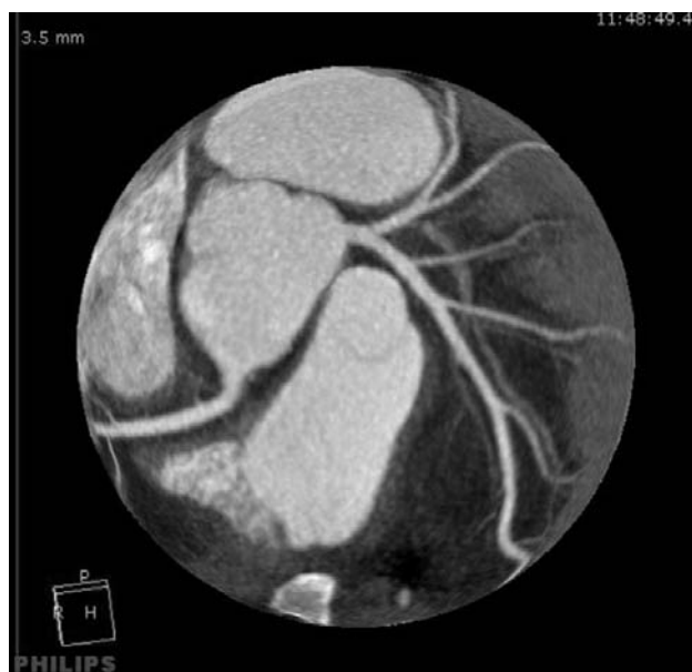
Figure 2. Non-invasive coronary angiogram performed by coronary 64-row multidetector computed tomography.

(iodine agent), high x-ray patient exposure (two times more important than coronary angiogram), coronary calcifications and vessel distal bed sub-optimal viewing leading to incomplete results, imprecise coronary narrowing quantification. CT includes the risk of a useless increasing indication of coronary angiogram due to this morphologic but no functional assessment of coronary arteries.