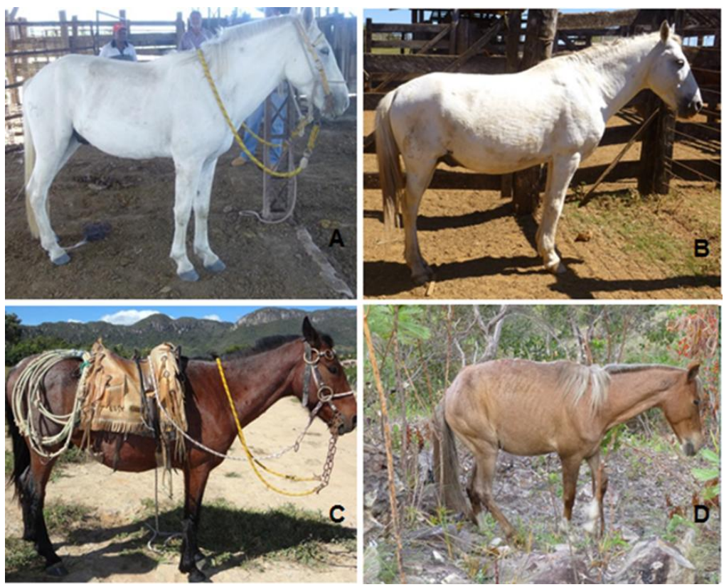
Figure 2. Horse specimens observed throughout the study in the Brazilian savannas. Common features for Curraleiro horses, as suggested by interviewees, are noticed in the animals A to C. A and B: Horses with similar morphology, showing small to medium body size and height, including "donkey hoof" and "pig hip"; C: Horse with small body and height, and hooves ideal for work according to its breeders; D: A mongrel horse, in spite of the specimen features did not match the expected ones for Curraleiro horses, in the figure it is possible to observe the stony ground of the region in which the Curraleiro horses are adapted and live in the Brazilian savannas. Category 3 – Historical aspects (Table 3).

warmblood animals (83.3%). However, the primary subcategories of Temperament and Characteristics of exclusion did not include relevant ECUs for the characterization of Curraleiro horses. Figure 2 shows common features for Curraleiros.