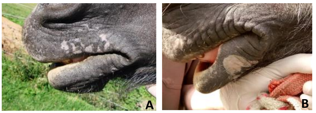
Figure 3. Male, 18-year-old gelding crossbreed roan-haired horse, with small depigmented patches ranging around 0.5cm in diameter on the upper left lip region, in 2014 (A) and development of a patch approximately 2cm in diameter on the lower left lip after four years, in 2018 (B).