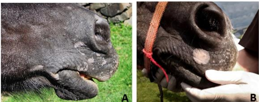
Figure 2. Male, 18-year-old gelding crossbreed roan-haired horse, with multiple small depigmented patches on the right upper and lower lip region, in 2014 (A) and regression of small patches and appearance of a circular lesion of approximately 2cm in diameter on the right upper lip after four years, in 2018 (B).