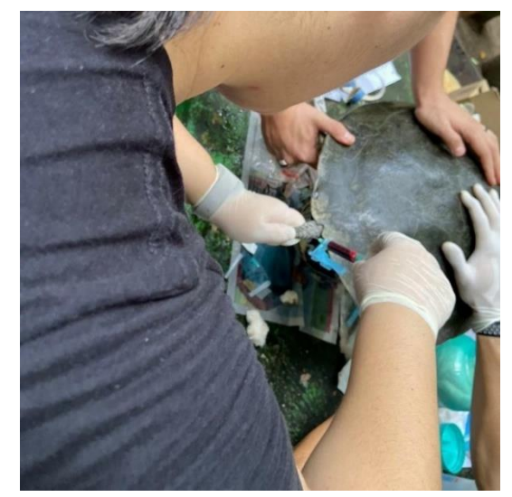
Figure 1. Blood collection from Amazonian-turtles ( Podocnemis expansa ) through puncture of the dorsal caudal vein.

DNA was extracted from the blood samples using the ReliaPrep<sup>TM</sup> Blood gDNA Miniprep System (Promega<sup>®</sup>, USA) following the manufacturer's protocol. The sequences of the primers specific to Leptospira spp. DNA, Lep 1 and Lep 2 as reported by Merien et al. (1992), were obtained from GenBank. Further, 5µL of DNA extracted from Leptospira , obtained from culturing Leptospira interrogans serovar Canicola in EMJH, and 5µL of sterile water were used as a positive and negative control, respectively. Polymerase chain reaction (PCR) was performed to detect a 331bp fragment following the protocol described by Rocha (2016).