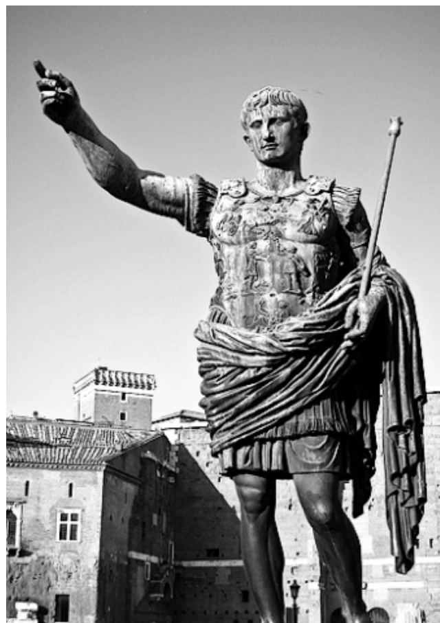
Image modified from Wikipedia ( https://pt.wikipedia.org/wiki/Dinastia_júlio-claudiana ).