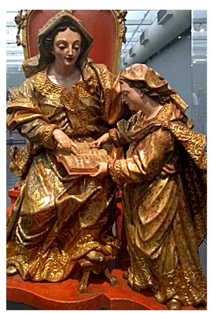
Source: 1778–1779, sculpture by Aleijadinho, Gold Museum, Sabará, Minas Gerais State, Brazil. Public domain.

The scope of the present study was to elucidate the most probable diagnosis of Aleijadinho's disease and discuss other diagnosis suggested in the literature.