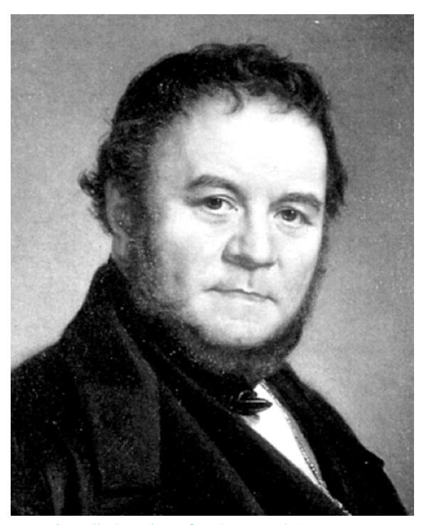
Figure 3. Stendhal, author of Le Rouge et le Noir.

of the 19<sup>th</sup> century, chiefly known for his works of fiction<sup>12</sup>. Stendhal was born in Grenoble in 1783 and died of a stroke that was preceded several months before by transient ischemic attacks (TIAs), manifested as impaired speech. He had several spells of speech loss which he described very precisely in letters and notes. He wrote to his friend Domenico Fiore: "[...] then, four spells of the following sickness: All of a