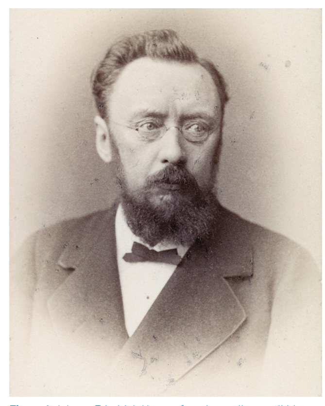
Figure 1. Johann Friedrich Horner, from https://www.wikidata.org/wiki/Q123315.

The plexus then rises to the cavernous sinus, and follows the ophthalmic division of the trigeminal nerve to the orbit, where it feeds the dilating muscles of the iris and the smooth muscle fibers of the upper and lower eyelids. The vasomotor fibers and the sweat glands to the face take a different course after leaving the ganglion. They follow the external carotid artery to supply half of the face on the same side. Horner syndrome (HS) can result from an interruption, at any level, of the sympathetic fibers supplying the eye and face<sup>2</sup>.