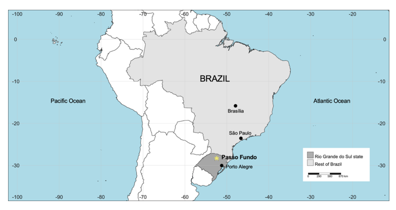
Map created using SimpleMappr®, available at https://www.simplemappr.net. Figure 2. Location of Passo Fundo, in Rio Grande do Sul state, Southern Brazil.

Epidemiological and clinical features of the MS patients living in Passo Fundo on the prevalence day are described in Table 1. Among the 52 MS cases, 42 (80.8%) were female, for a sex ratio of 4.2:1. The median age on the prevalence day was 40 years (range, 19 to 76 years). Regarding ethnicity, there were 51 (98.1%) Caucasians and 1 (1.9%) mixed ancestry individual (Caucasian/African).