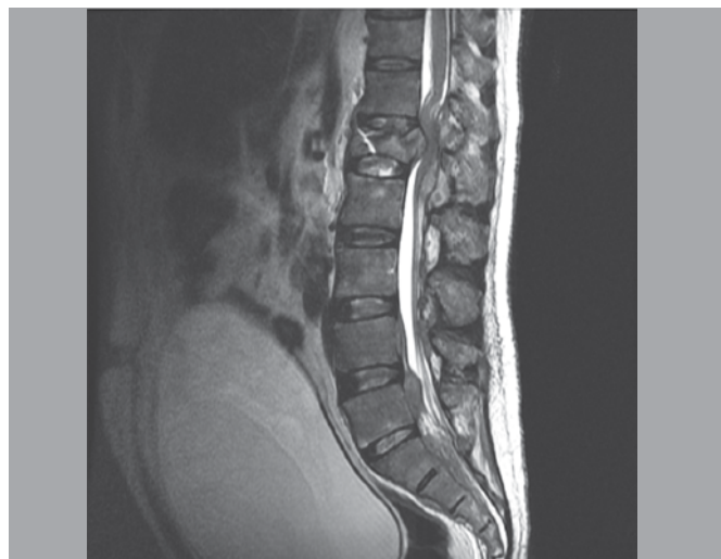
Figure 3. Pathologic fracture of L1 in 55-year-old male patient, admitted with a three-month history of low back pain and presenting neurological deficit and loss of sphincterian control for one week.

Patients with a diagnosis of CES confirmed after detailed clinical history and neurological examination upon admission and investigation with computed tomography and magnetic resonance imaging scans of the lumbosacral spine were included. All the cases from the sample had the initial and postoperative physical examinations, and the evolution of the disease well documented in the medical records.