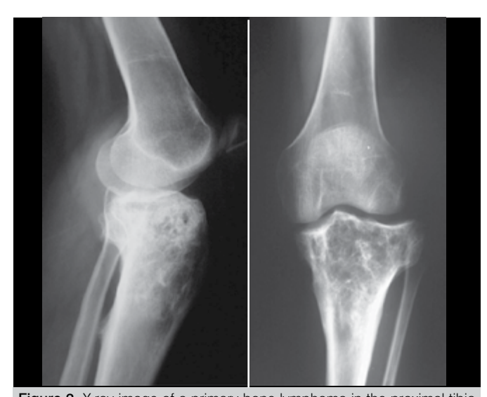
Figure 2. X-ray image of a primary bone lymphoma in the proximal tibia (after chemotherapy).

shows the improved access to public health that residents in some areas of Brazil currently enjoy. However, and particularly in our study, time of diagnosis did not affect the prognosis of patients with PBL. As expected, the epidemiological characteristics of PBL were found in our series: the median age was in the fifties and sixties, men were more prevalent, and pain was the main symptom. An important difference from the literature is that the most frequently affected site was the vertebrae, as we also found in our previous publication.<sup>10</sup> Other studies generally show that the femur is most frequently affected. 15,16 Few prognostic factors were found in the statistical analysis. In our study, age appears to be a prognostic factor, which is compatible with the literature;<sup>4,16</sup> younger patients had a more favorable prognosis for survival. There is no consensus on the significance of the prognosis and location of disease involvement (axial or appendicular). We also did not find a statistically significant difference in site affected in relation to survival prognosis in our series. 3,10,17 The IPI scale is not used universally for reporting PBL, but in our study we found that most patients were classified as low grade, which is similar