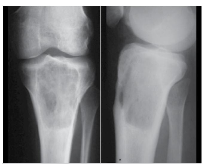
Figure 1. X-ray image of a primary bone lymphoma in the proximal tibia (prior to chemotherapy).