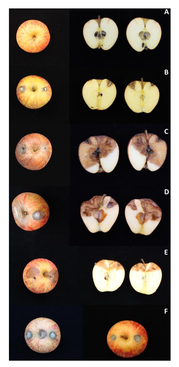
Figure 3. Symptoms of Neonectria ditissima , Colletotrichum sp., Botryosphaeria sp., Alternaria sp. and Fusarium sp. isolates from twigs inoculated as mycelial plugs on Potato Dextrose Agar (PDA) on detached wounded 'Gala' apple fruit. A = Control (PDA plug without fungi), B = Neonectria ditissima , C = Colletotrichum sp., D = Fusarium sp., E = Botryosphaeria sp., and F = Alternaria sp.

Letters indicate significant difference by t test at 5% between periods of collection, considering twenty replications for each orchard at each time of sampling. <sup>1</sup>Humid Chamber; <sup>2</sup>Overnight Freezing + Humid Chamber.