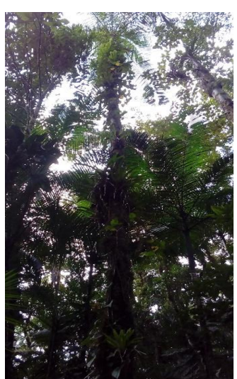
Figura 2 - Natural resources from the case studies: juçara, arapaina, and meliponine

The extraction of the jucara heart of palm (Euterpe edulis) in the Atlantic forest illustrates how the dilemma of resource appropriation can also characterize users' insertion in exogenous conflict resolution models. As the removal of the heart of palm depends on cutting down the palm trees, this production causes tremendous ecological pressure on the species. The risk of extinction due to unrestrained use results from environmental regulations introduced with the creation of Integral Protection UCs, which changed the governance of the resource (MARINHO; FURLAN, 2008; REIS et al., 2000). In addition to palm tree felling, the defaunation of large frugivores is another threat to the extinction of the jucara (GALETTI et al., 2013), producing genetic homogenization among palm populations (CARVALHO et al., 2016). Located in the most extensive remnants of the country's Atlantic forest, the Ribeira Valley is home to a set of protected areas in southeastern Brazil, whose surroundings are occupied by rural communities that, faced with the impediment of cutting down, have become extractivists and clandestine hunters (GALETTI; FERNANDEZ, 1998). In the region, extractivist communities interact with different policy regulations and environmental organizations and are encouraged to adapt to income generation alternatives, little known by extractivists. Despite the proposal of sustainable practices, these communities are significantly pressured by police patrols around the protected areas.