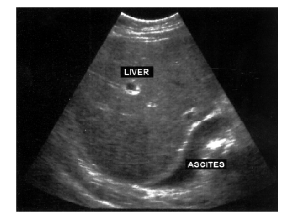
Figure 2. Abdominal Ultrasound showing hepatosplenomegaly