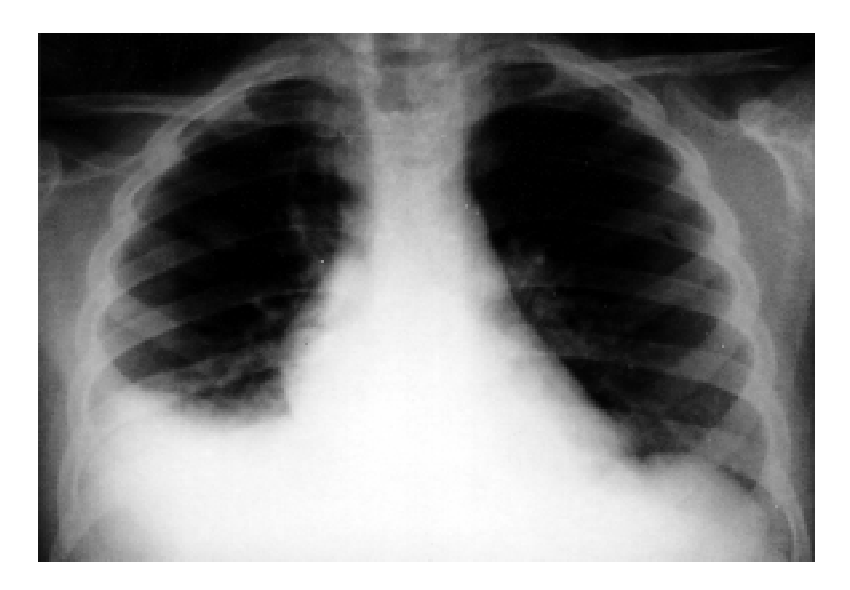
Figure 1. Posteroanterior chest x-ray showing pleural effusion

(a) bilateral, greater on the right; (b) hepatosplenomegaly and low-volume ascites; (c) exclusively hepatosplenomegaly.