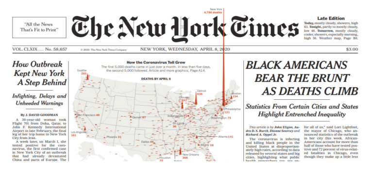
Figure 2 – Detail from the NYT headline "How the Coronavirus Toll Grew"