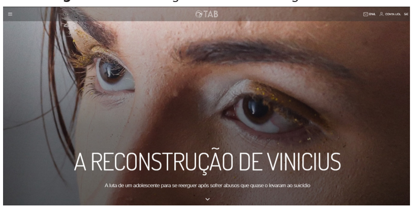
Figure4 -Cover image for Reconstructing Vinicius

Issue 112, Reconstructing Vinicius, published on 8/5/2017, presents topics such as bullying and suicide. The text starts describing Vinicius' experiences of suffering from bullying at school, attempting to commit suicide, and then eventually discovering a way to express himself through the drag movement (Figure 4). The multimedia features include 14 blocks of text, one video, one infographic, and 20 photographs.