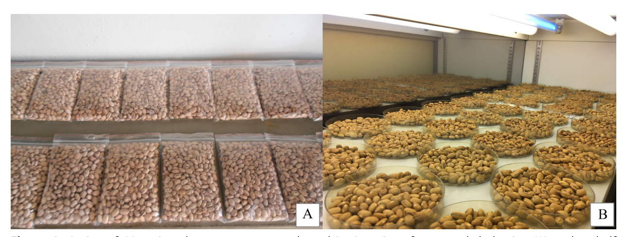
Figure 1: Grains of 19 carioca bean genotypes evaluated in Campinas for natural darkening (A) under shelf conditions at 0, 30, 60 and 90 days, and accelerated (B) in chamber conditions with ultraviolet and fluorescent lamps with colorimetric readings (dry and rainy), Tatuí (dry), Votuporanga (winter), Ribeirão Preto (winter) and Mococa (rainy), state of São Paulo.

The method introduced for accelerated grain darkening was used by assembling a system with minor modifications of ultraviolet and white fluorescent lamps and conditions, such as distance from the samples to the 10 cm to 18 cm lamps. The irradiance measurement showed a significant difference compared to the 4 mW cm<sup>-2</sup> of ultraviolet irradiance previously published by Junk-Knievel, Vandenberg and Bett (2007). The total light fluence represents the total amount of photons of ultraviolet and visible light that passed through the area where the beans were placed. In order to calculate the total light fluence (J cm<sup>-2</sup>), it first measured the power per area unit (mW cm<sup>-2</sup>) using a power meter (previously described) and multiplied the value obtained by the time of illumination (seconds).